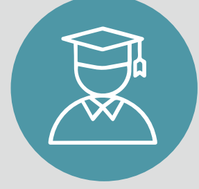
CULMINATING SENIOR EXPERIENCE

Web accessibility upgrades were made to the Project Outcome toolkit, using WebAIM's WCAG 2 checklist as a guide.