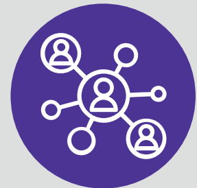
RESEARCH WITH FACULTY