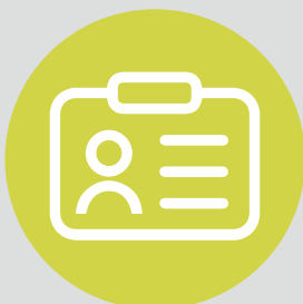
INTERNSHIP OR FIELD EXPERIENCE